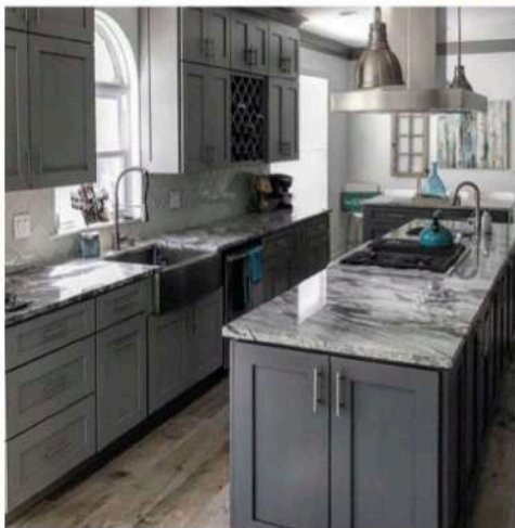
Current Gray Trend